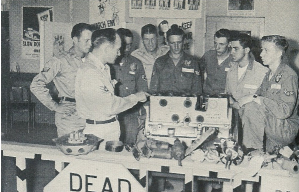
Drivers are instructed on the 4 cylinder engine, England AFB, LA, 1955.