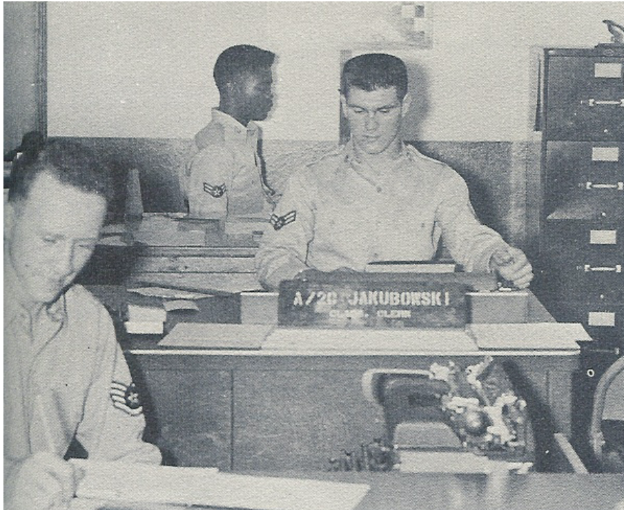
366 MVS, England AFB, LA Orderly Room, 1955