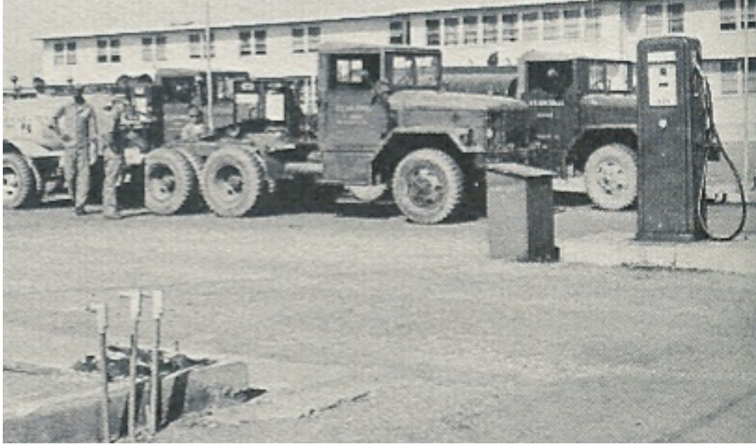
Vehicles gas up at the motor pool filing station, England AFB, LA, 1955.