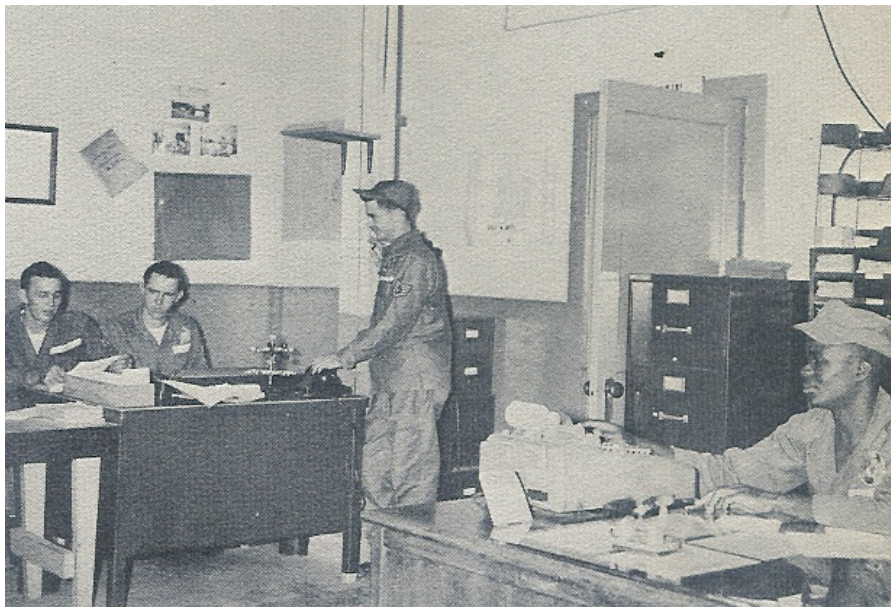
Office personnel of drivers school and accident investigation section, 366 MVS, England AFB, LA, 1955